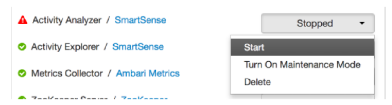
Issue 3 : In rare cases, SmartSense View may display the following error:

If the Restart All option is disabled, start each SmartSense component individually: